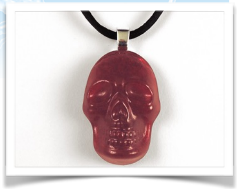
Variations Don't forget: Skulls are a natural for fun, edgy jewelry.

Once all the dots are in place, cap the dots and the glass strips with the 7 by 10 panel.